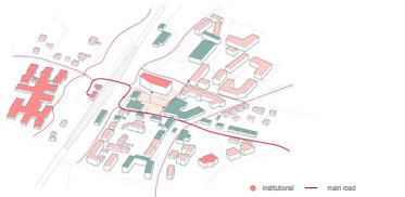
urban strategy 2: spatial connection & relation with context