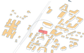
urban strategy 1: densification through extension